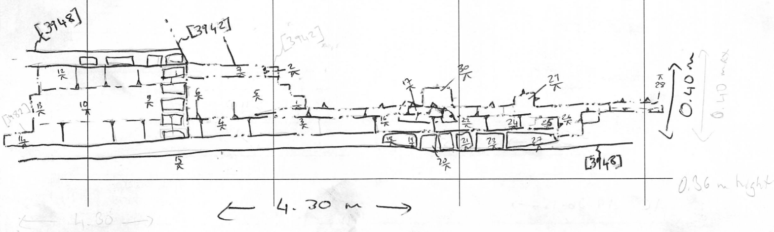
Sketch Plan & Notes